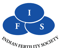
Indian Fertility Society (IFS), Bihar Chapter,