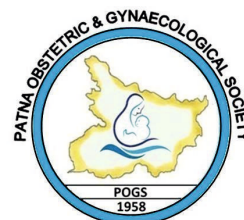
Patna Obstetrics & Gynecological Society (POGS)